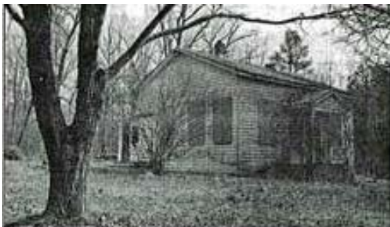
Deep Run School before renovation

Deep Run has our own little piece of history. The Deep Run School was a two-room schoolhouse opened in 1902. Its predecessor, Stand Spring School, had been destroyed by fire the previous year. The school was in use until 1911 offering seven grades of instruction. Wood stoves provided heat for the structure and a privy was located outside. By folding the center wall of doors the space converted into one large room for weekly square dances for the entire community. The County of Henrico moved the school to this location from Three Chopt Road in 1996. For find out more about what is being planned to commemorate this milestone in Henrico County visit www.henrico400th.com .