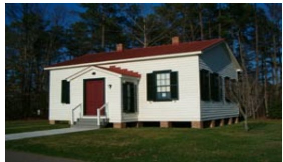
Deep Run School following renovation